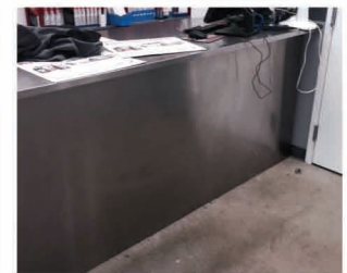
Painted Or Stainless Steel Front Cover Panels Available - Sold Separately