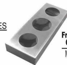
Free-Standing Cup Holder Model #670199