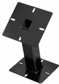
Pedestal Mount For Intercom Console Model #963013