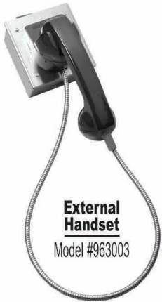
External Handset Model #963003