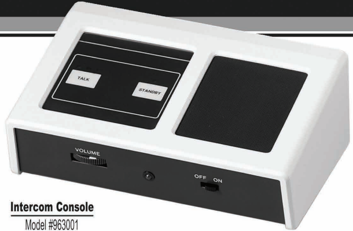
Intercom Console Model #963001