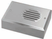
External Speaker Model #963008