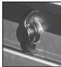
Deal Tray Lock

Duo-Drawers® are an ideal solution for pharmacies, convenience stores, correctional facilities, law enforcement, fast food restaurants and government facilities.