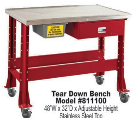
Tear Down Bench Model #811100 48"W x 32"D x Adjustable Height Stainless Steel Top