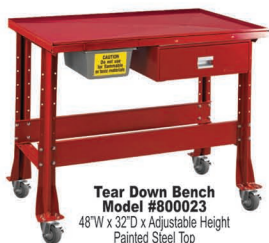
Tear Down Bench Model #800023 48"W x 32"D x Adjustable Height Painted Steel Top