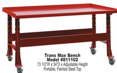
Trans Max Bench Model #811102 73 1/2"W x 34"D x Adjustable Height Portable, Painted Steel Top