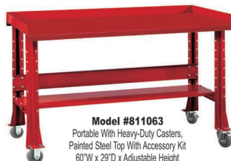
Model #811063 Portable With Heavy-Duty Casters, Painted Steel Top With Accessory Kit 60"W x 29"D x Adjustable Height