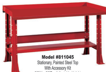
Model #811045 Stationary, Painted Steel Top With Accessory Kit 60"W x 29"D x Adjustable Height