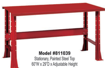
Model #811039 Stationary, Painted Steel Top 60"W x 29"D x Adjustable Height