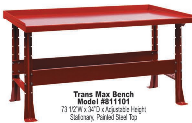
Trans Max Bench Model #811101 73 1/2"W x 34"D x Adjustable Height Stationary, Painted Steel Top