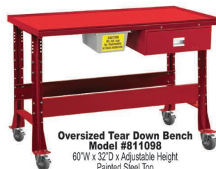
Oversized Tear Down Bench Model #811098 60"W x 32"D x Adjustable Height Painted Steel Top