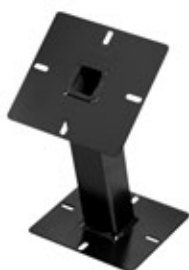
Pedestal Mount For Intercom Console Model #963013