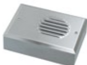
External Speaker Model #963008