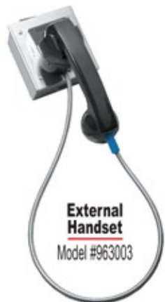
External Handset Model #963003