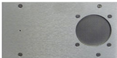
External Speaker Unit Non-Secured Side