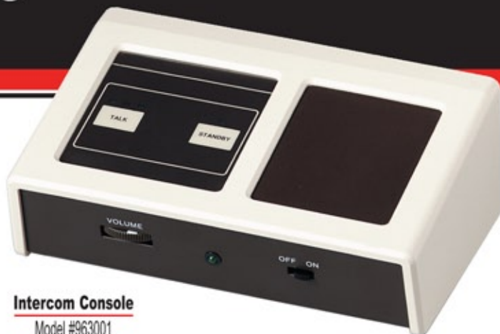
Intercom Console Model #963001

Shuresafe Security, Storage & Safety Solutions